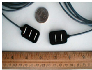
Fig. 2. Single and double differential electrodes

implemented based on the muscle of interest zone [5] (Fig.2). When measuring activity of the wrist/finger